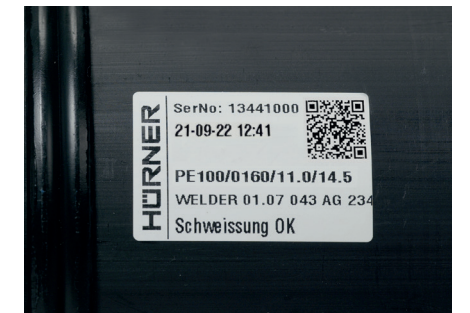
Tag printer and label tags

Immediate quality labeling of every welded joint is possible with the optional dedicated tag printer that delivers an abrasion-proof plastic sticker which can be used as a label on the fitting or joint.